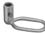
No. 758 Loop