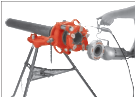
700 Power Drive

Power Threading with Geared Threaders – Nos. 141, 161 – Close couple method of threading.